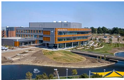
Wichita State - Woolsey Hall